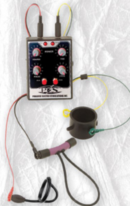
The ORIGINAL PES POWER BOX shown above with the BASIC CORONA "COCKHEAD" STIMULATOR in circuit with the ANAL TUBULAR on CHANNEL A & a single pole ELECTRO-FLEX™ PENILE RING on the green wire and plugged into CHANNEL B for a 3-ELECTRODE CONFIGURATION . ELECTRODES sold separately.

More information can found on the P.E.S. website: HTTPS://WWW.PESELECTRO.COM under the 'INFORMATION' links at the bottom of the HOME PAGE . Specifically under the 'PRODUCT SAFETY & INFORMATION LINKS' .